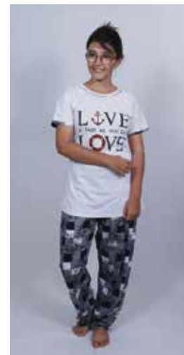
Ladies Night Suit