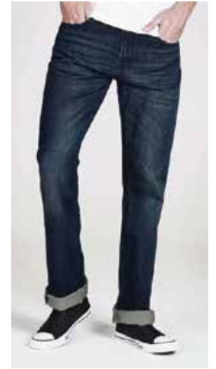
Men's Jeans & Trousers